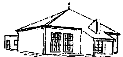
OUR LADY OF GRACE, Booker