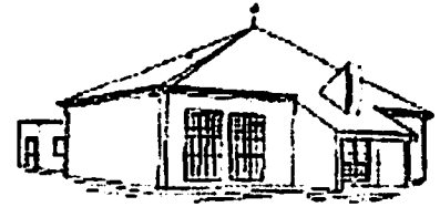
OUR LADY OF GRACE, Booker