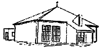
OUR LADY OF GRACE, Booker