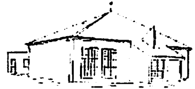
OUR LADY OF GRACE, Booker