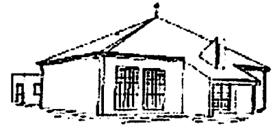
OUR LADY OF GRACE, Booker