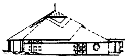
ST WULSTAN, Totteridge