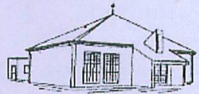
OUR LADY OF GRACE, Booker