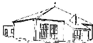
OUR LADY OF GRACE, Booker