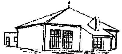
OUR LADY OF GRACE, Booker