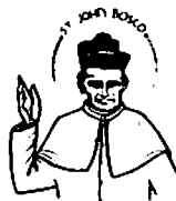
St. John Bosco