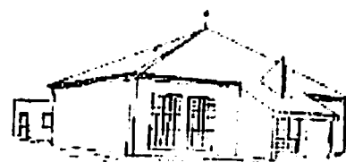
OUR LADY OF GRACE, Booker