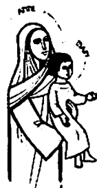
Presentation of BVM

Sat. Presentation of the Blessed Virgin Mary